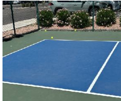
Balls were left on the Court after the players have left the Court.